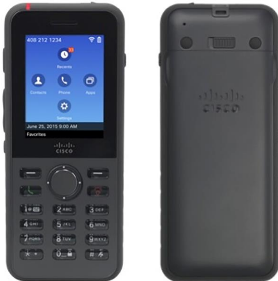
Figure 1. Cisco Wireless IP Phone 8821